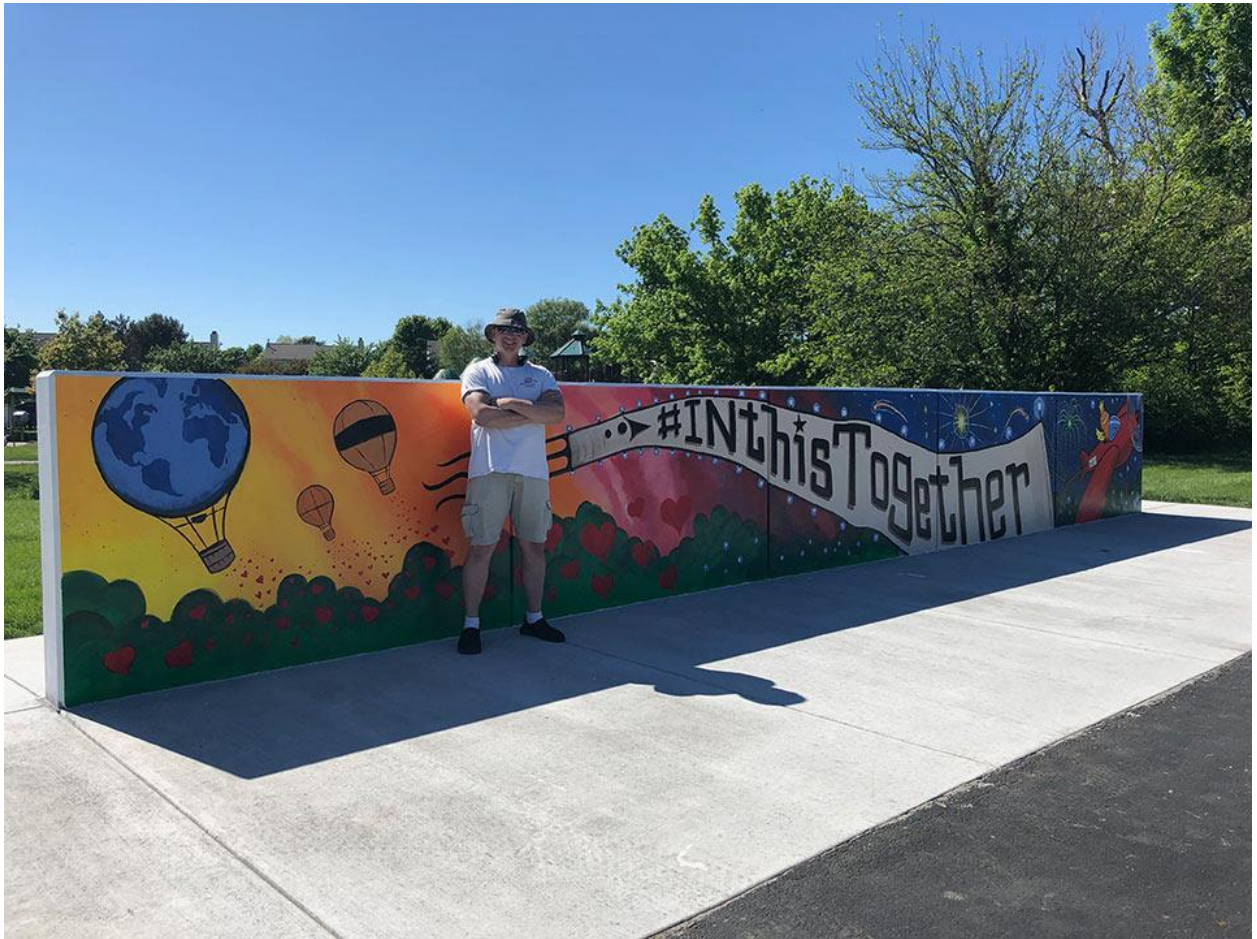
Fisher Park, Indiana