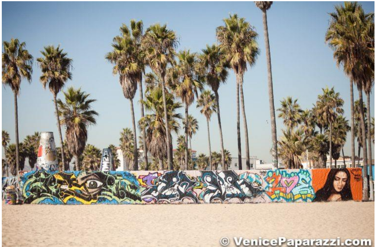
Art Wall at Venice Beach