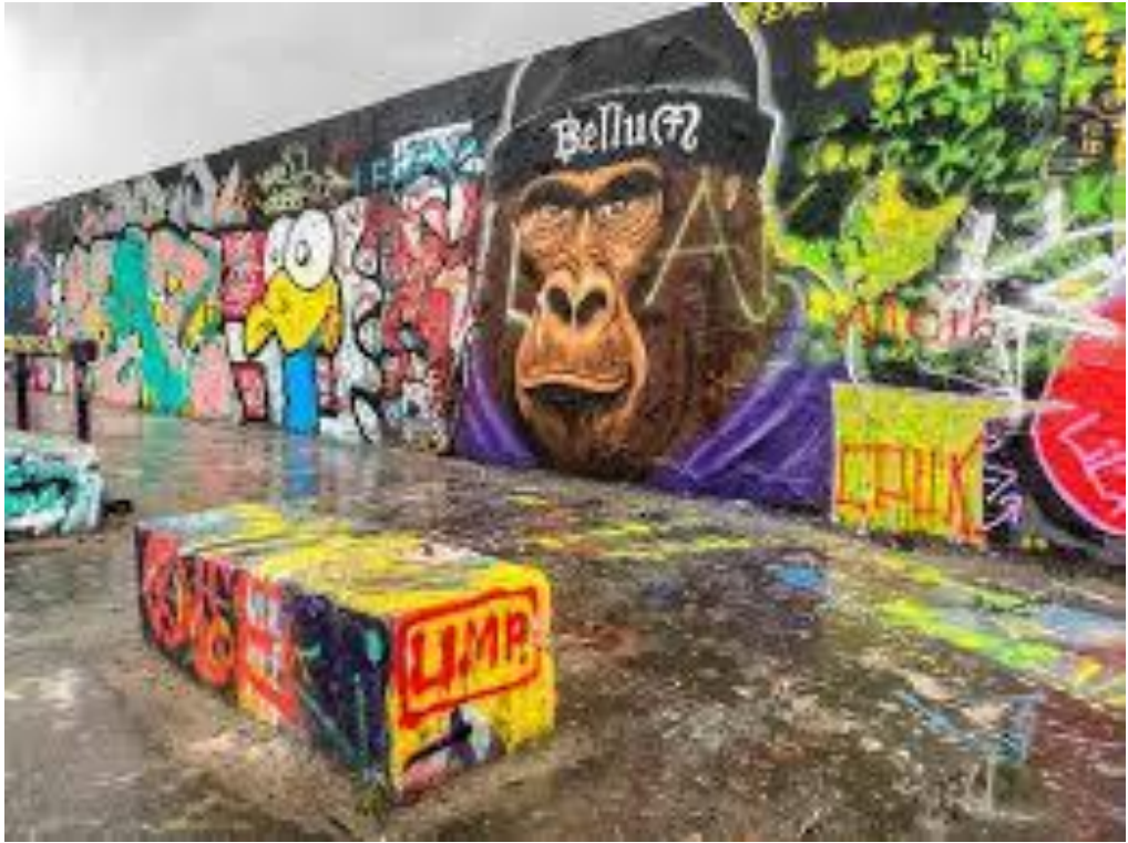
Berlin Street Art and Graffiti